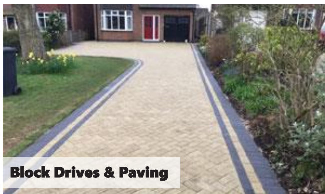
Block Drives & Paving