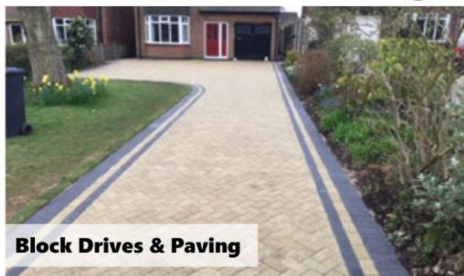
Block Drives & Paving